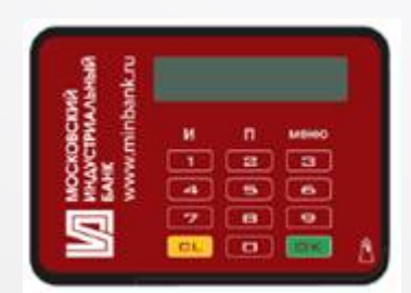
Московский Индустриальный Банк